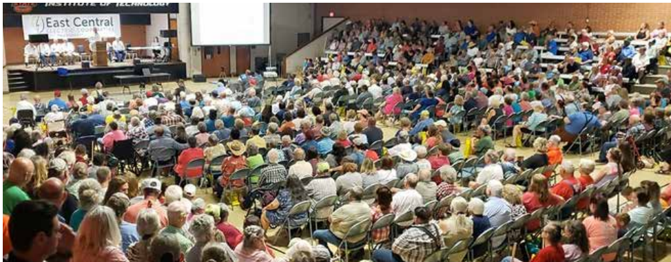
Members pack the house at the ECE Annual Meeting on July 25. Held at the OSU Institute of Technology in Okmulgee, the event drew a record-breaking crowd.