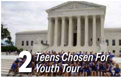
2 Teens Chosen For Youth Tour