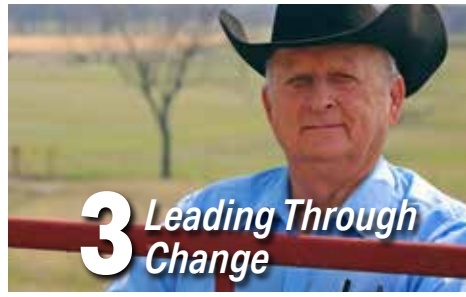
3 Leading Through Change