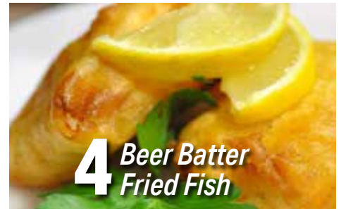
4 Beer Batter Fried Fish