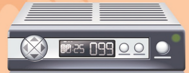
CABLE/SET TOP BOX